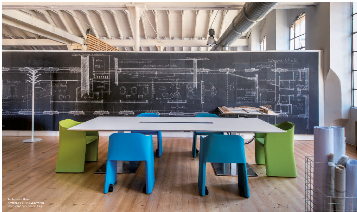
Table tavolo Plano Armchair poltrona Laja Wings Coat stand appendiabiti Flag